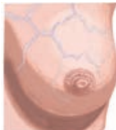
Enlargement and dilation of blood vessels