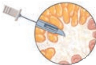
A breast (needle) biopsy may be needed for an accurate diagnosis.

An abnormal mammogram can be the first sign of possible breast cancer. Women over 40 years old should have mammogram screenings every 1 to 2 years.