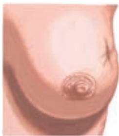
Dimpling of skin

As cancer grows, it can change how your breast looks.