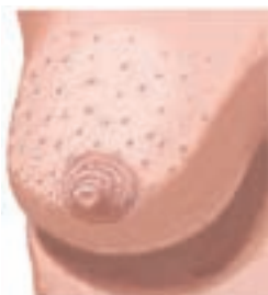
Orange peel appearance